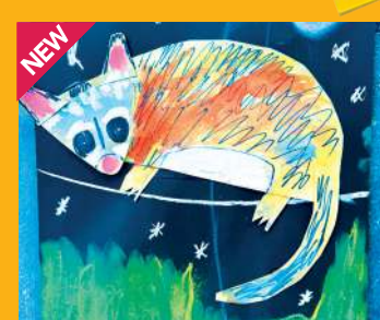
Little Possums Drawing/Painting/Collage