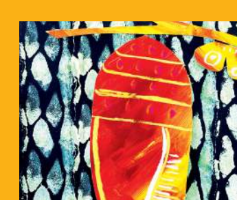
Cocoon Prints Printmaking