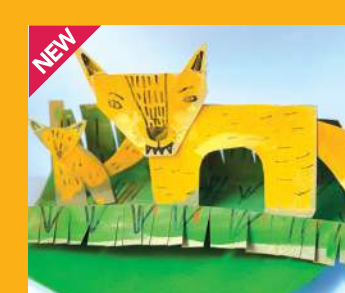
Upcycle Animal Scenes Mixed Media