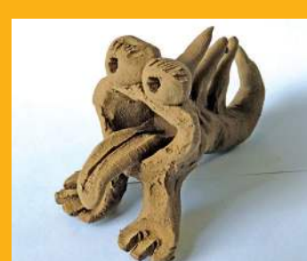
Clay Cone Critters Clay Sculpture