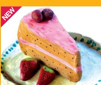
Pop Art Cakes 3D Clay Sculpture