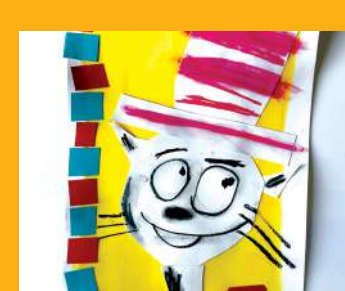
The Cat in the Hat Mixed Media