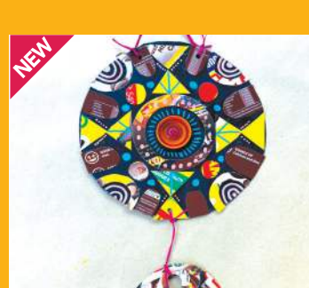
Upcycle Mandalas Mixed Media