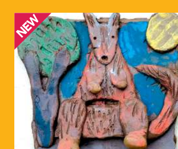
Kangaroo Clay Tiles Clay