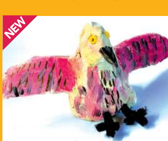
Beautiful Birds Clay Sculpture