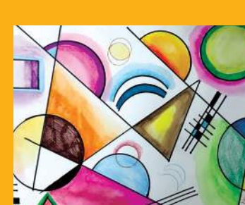
Who is Kandinsky? Drawing/Painting