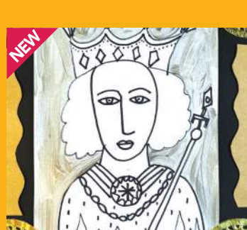
Medieval Portraits Mixed Media