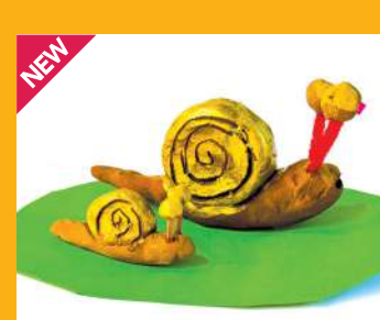
Slimey Snails Clay Sculpture