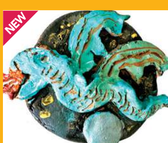
How to Train a Dragon Clay