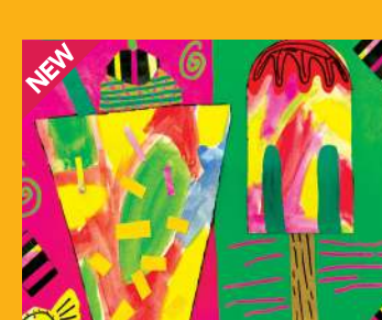
Willy Wonka Sweets Drawing/Painting/Collage