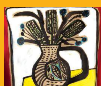
Who is Margaret Preston? Artist Spotlight Drawing/Painting