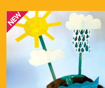
3D Water Cycles Sculpture