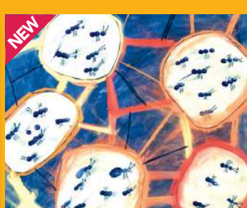
Awesome Ant Colonies Group Project