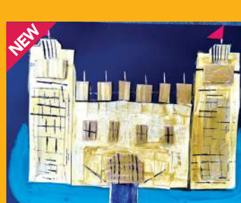
Upcycle Castle Collages Mixed Media