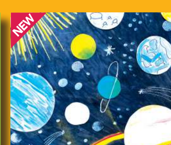
Outer Space Murals Group Project