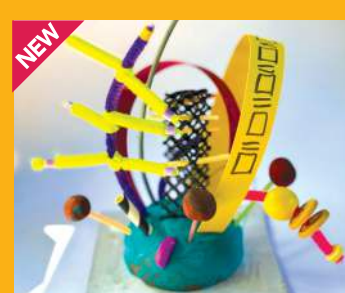
3D Roller Coasters Sculpture