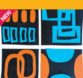
Maths Art Collage