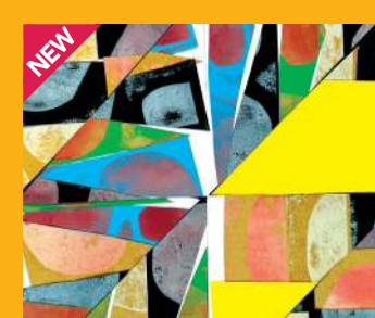
Patchwork Prints Printmaking