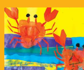
Sand Crab Prints Printmaking