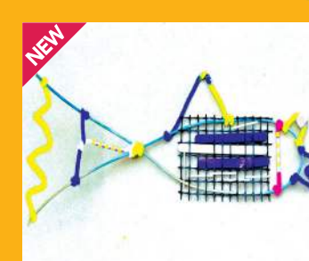
Funky Fish Weavings Sculpture