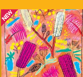
Aussie Flora Murals Group Project