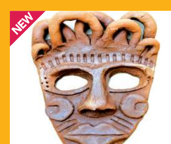
Clay Masks Clay