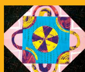
Monoprint Mandalas Printmaking