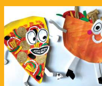
Fun Food Friends Mixed Media