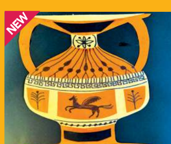
Greek Pottery Designs Drawing/Collage