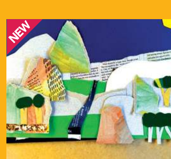
Upcycle Landscapes Mixed Media