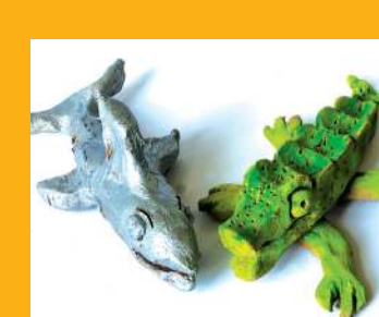
Sharks V Crocodiles Clay Sculpture