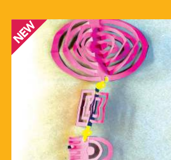
Op Art Mobiles Sculpture