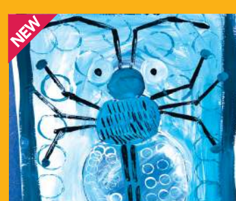
Monochrome Bugs Drawing/Painting/Print