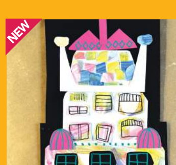
Who is Antonio Gaudi? Mixed Media