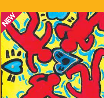
Keith Haring Figures Group Project