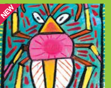
Incredible Insects Group Project