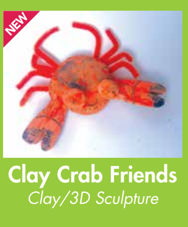
Clay Crab Friends Clay/3D Sculpture