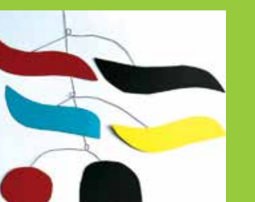
Who is Alexander Calder? Artist Spotlight Mobiles/Sculpture