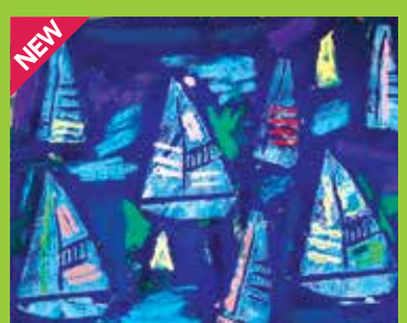
Sail Boat Prints Printmaking