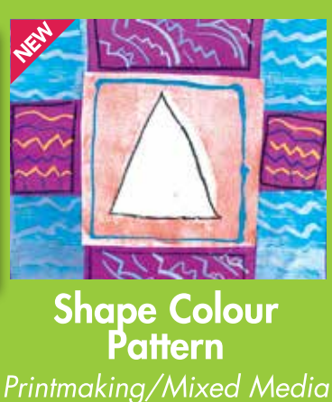
Shape Colour Pattern Printmaking/Mixed Media