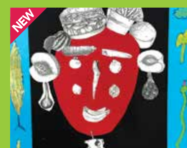
Who is Giuseppe Arcimboldo? Collage/Mixed Media