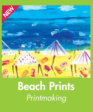
Beach Prints Printmaking