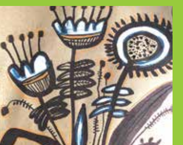
Still Life Designs Drawing/Painting