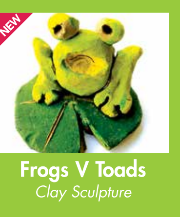
Frogs V Toads Clay Sculpture