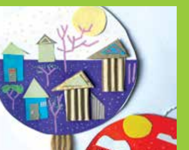
Looking at the Seasons Mixed Media