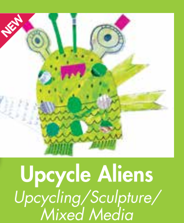
Upcycle Aliens Upcycling/Sculpture/Mixed Media