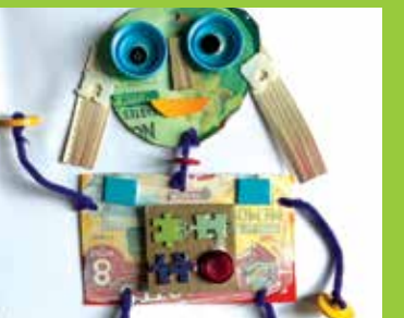
Junky Puppets Upcycling