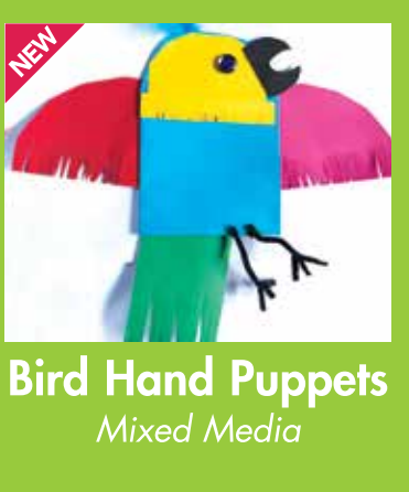
Bird Hand Puppets Mixed Media