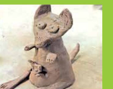
Aussie Cone Animals 3D Clay Sculpture