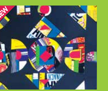
Packaging Abstraction Upcycling/Collage