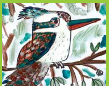
Painting Kookaburras Drawing/Painting