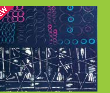
Print Stamp Design Printmaking