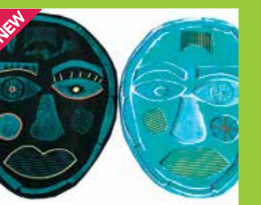
Face Blocks Printmaking