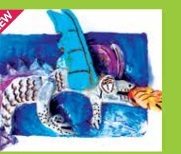
Clay Dragon Tiles Clay