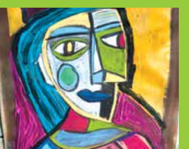
Big Picasso Heads Group project Artist Spotlight Drawing/Painting