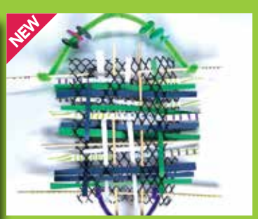
Wonderful Weaving Textiles/Mixed Media