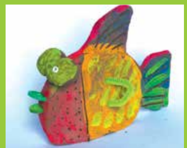
Tropical Fish Clay Sculpture