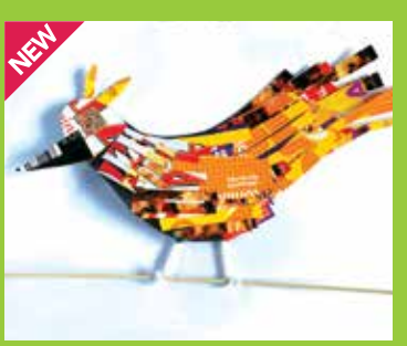
Upcycle Bird Collages Upcycling/Collage/Mixed Media