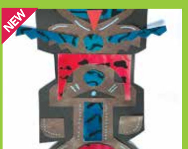
Totally Totems Photo Media