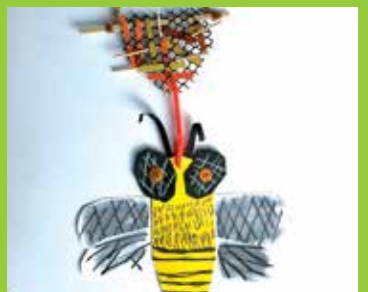
Buzzy Bees Sculpture