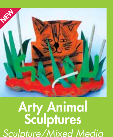
Arty Animal Sculptures Sculpture/Mixed Media