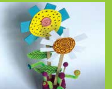
Little Flower Pots Clay/Sculpture