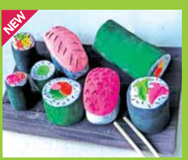
Sushi Sculpture Clay Sculpture