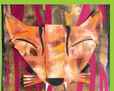
Camouflage Jungle Faces Mixed Media