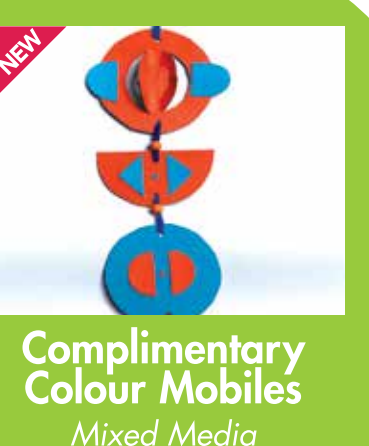
Complimentary Colour Mobiles Mixed Media