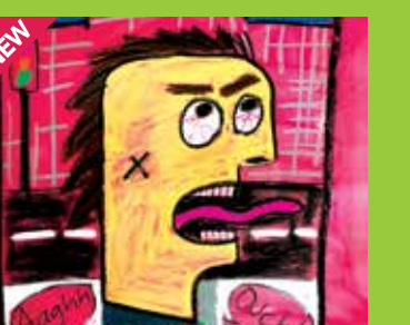
Cool Cartooning Group Project Drawing/Painting