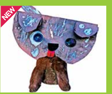
Clay Cats and Dogs Clay Sculpture/Mixed Media