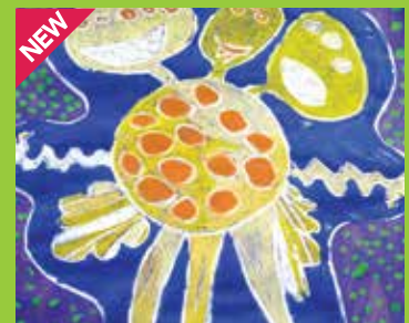
Mad Monsters Group Project Drawing/Painting